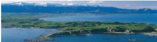
New Zealand Southern Explorer - $1195

Navitas English has partnered with Peterpans to offer our students specially discounted travel deals