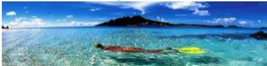
Fiji Tropical Island Explorer - $1198

For more travel ideas and to book visit www.navitasenglishtravel.com