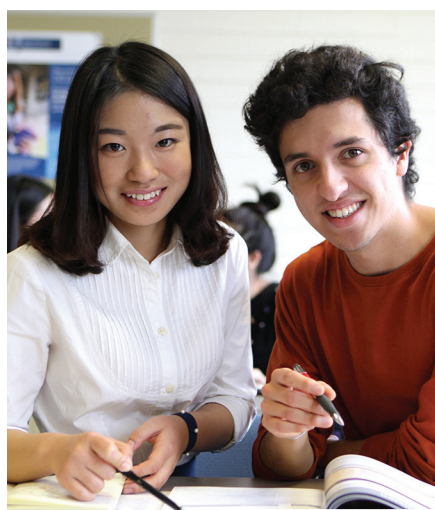
Make new friends