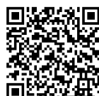
Meet our Students