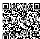
Meet our Teacher